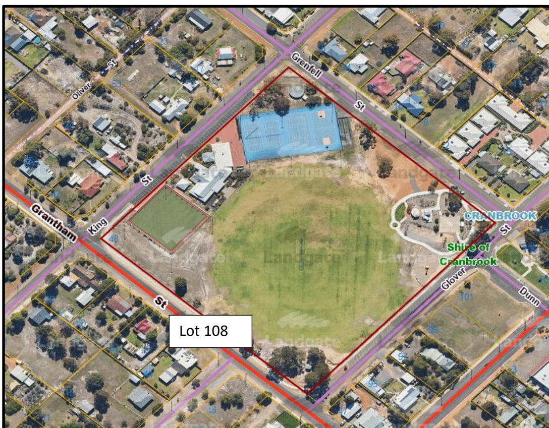
Above: Aerial Plan

The existing bowling green is located adjacent to King Street on Lot 62. Lot 62 is owned by the State of Western Australia however there is a Management Order to the Shire of Cranbrook. The lot has an area over 4 hectares. An aerial is included below.