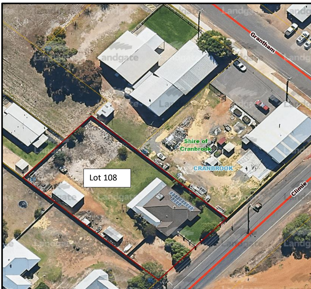
Above: Aerial Plan

The lot has an area of 2012m 2 and has been developed with a single house, associated outbuildings and a patio. An aerial is included below.