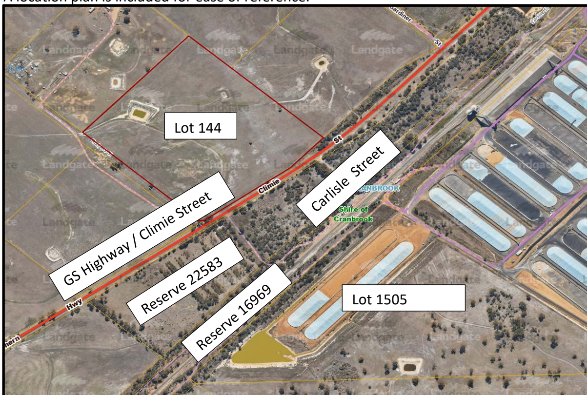
Above: Location Plan

A location plan is included for ease of reference.