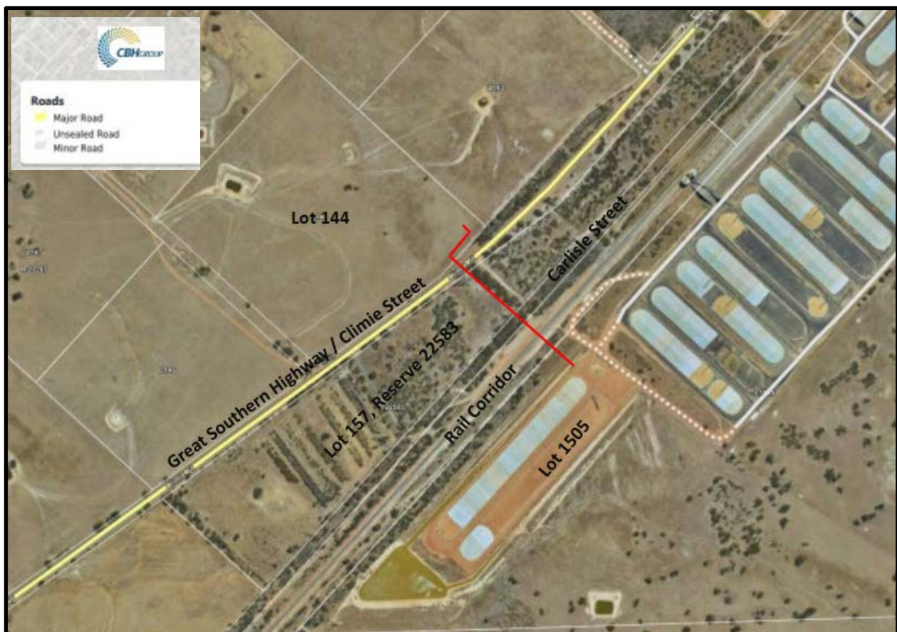
Above: Simplified site plan showing approximate route for underground power in a red line

TPI requested that CBH provide a simplified site plan which is included below for ease of reference.