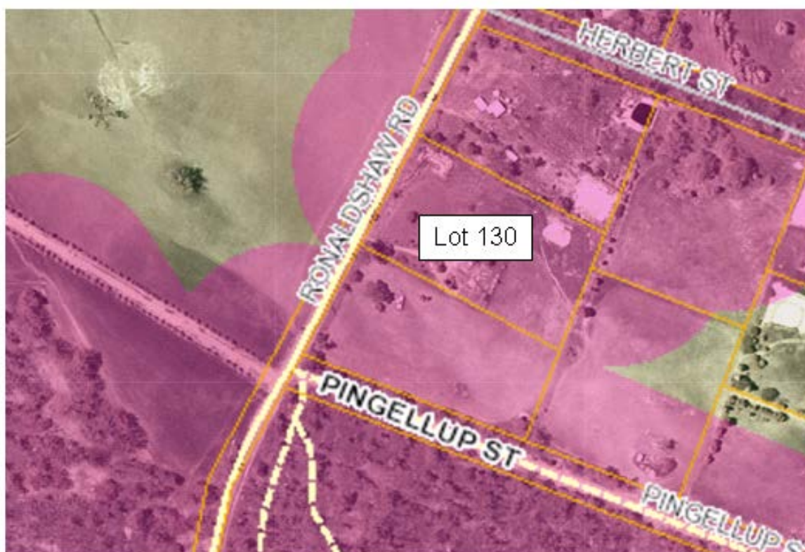
Extract of bushfire mapping – Source: www.dfes.wa.gov.au

All of Lot 130 is within the declared bushfire prone area (pink area), including the existing dwelling.